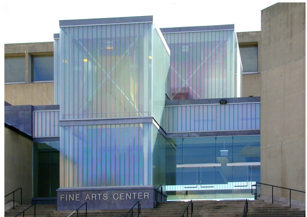
Low-E thermal performance coating