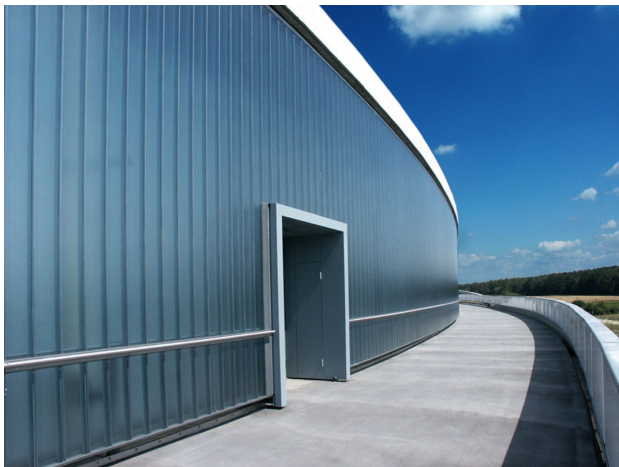
Azur thermal performance coating