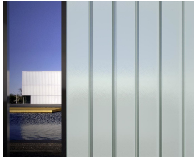
Channel glass wall with Wacotech insulation