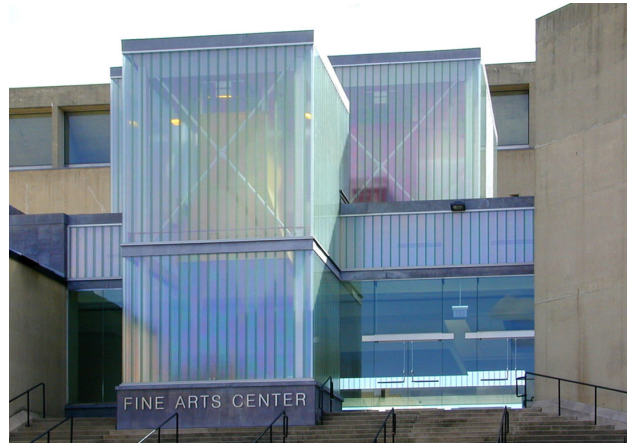
Low-E thermal performance coating