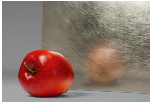
Matte ("Soft Etched") "Palest Bronze Brushed Fiber" Mirrored Architectural Glass