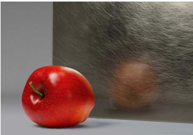
"Steel Brushed Fiber" Mirrored Architectural Glass