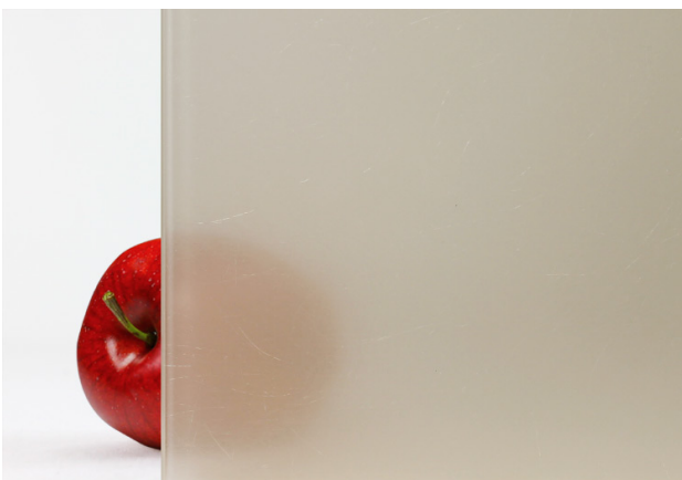
+2 sound control interlayer in combination with a denser "tan" colored interlayer